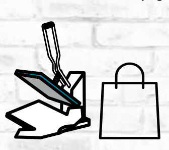
Heat Press Locally